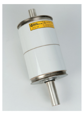
External view of typical vacuum interrupter.